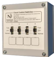
980-4-SA Manual Switches