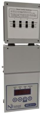
MC3 Master Clock with 4SW Switches