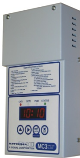
MC3 Master Clock